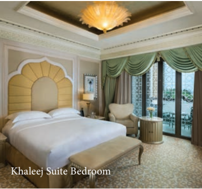
Khaleej Suite Bedroom

Our collection of six suite configurations, ranging from one to three bedrooms, with views of the endless sea or city, are the ultimate in luxury, promising grandeur and a stay that quite simply has no equal.