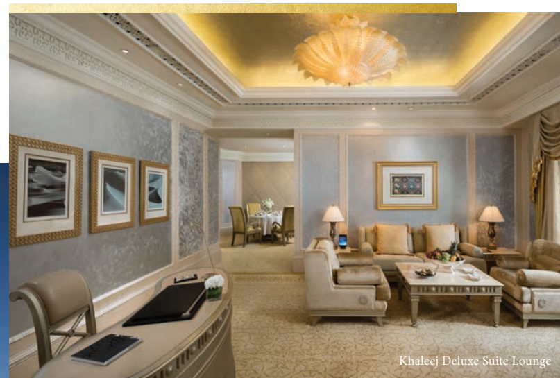
Khaleej Deluxe Suite Lounge

The iconic Emirates Palace is the pinnacle of luxury, reflecting the true warmth and generosity of Arabian hospitality.