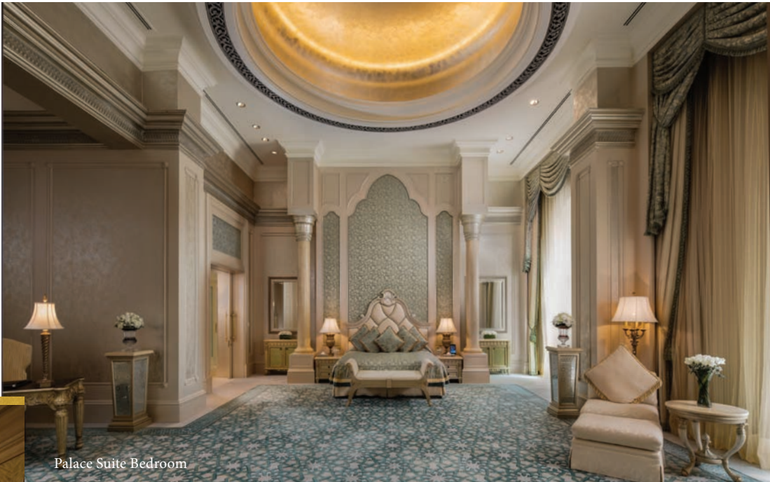
Palace Suite Bedroom