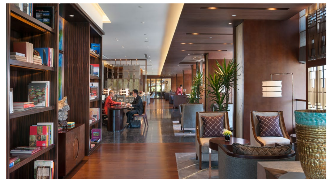
An exclusive retreat for guests of our Club rooms and suites, the luxurious Club Lounge is located on the Hotel's second floor and offers a private, relaxing lounge with meeting space, breakfast, snacks, and beverages.