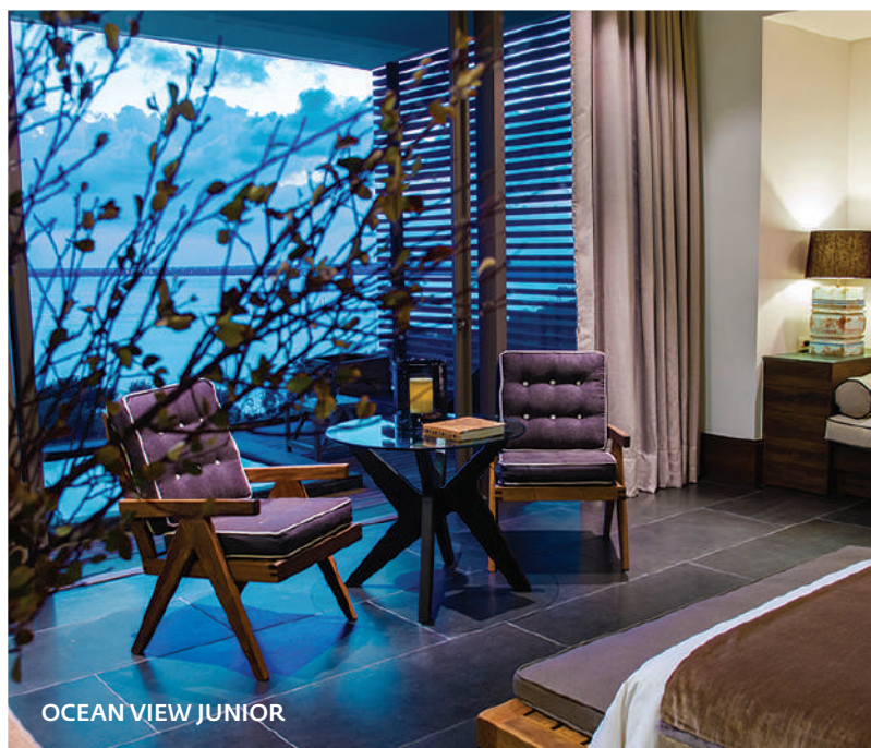
OCEAN VIEW JUNIOR