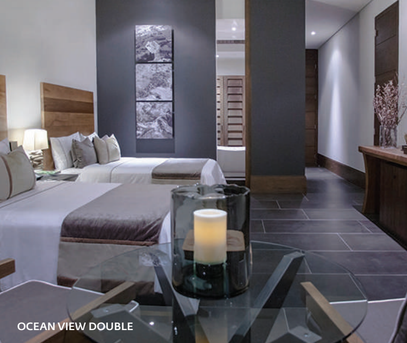
OCEAN VIEW DOUBLE